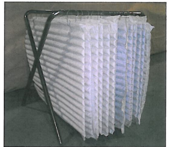
Curtains on hanger.